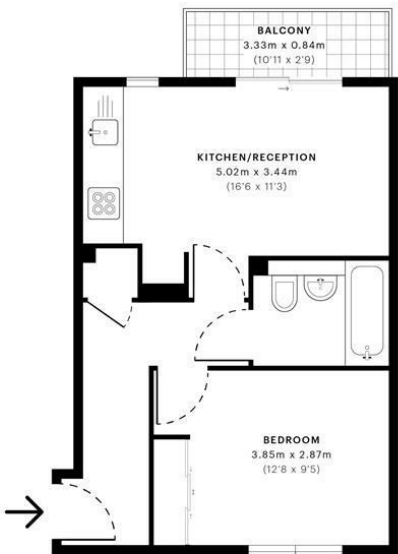
— Third Floor

GROSS INTERNAL AREA (GIA) The footprint of the property 38.44 sqm / 413.76 sqft