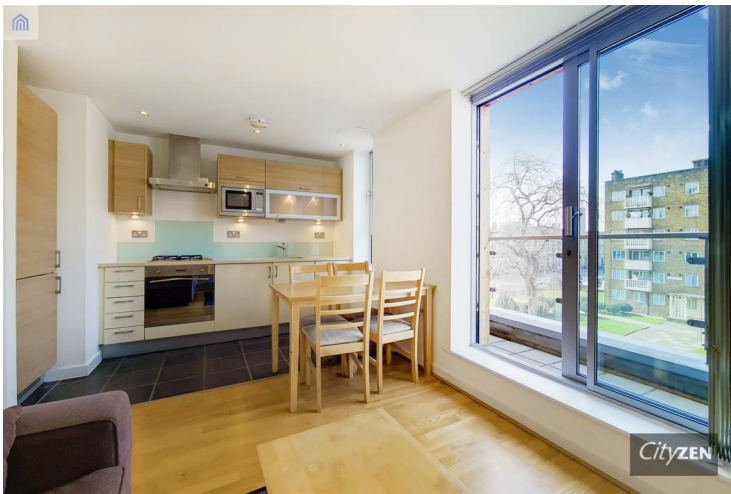
RECEPTION ROOM VIEW